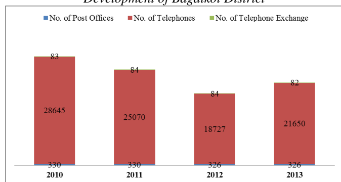
Table 2: Details of Communication Infrastructure Development of Bagalkot District

Source: District Official Website Annual Reports