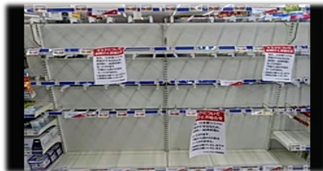
Figure 2: shelves in a pharmacy in Japan sold out of masks