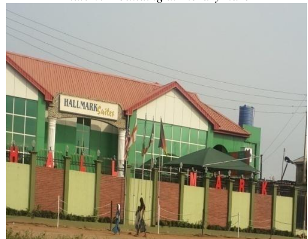
Plate 6: A building at Library Ilaro