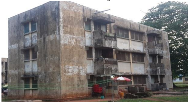
Plate 3: Residential building at Sanni Abeokuta