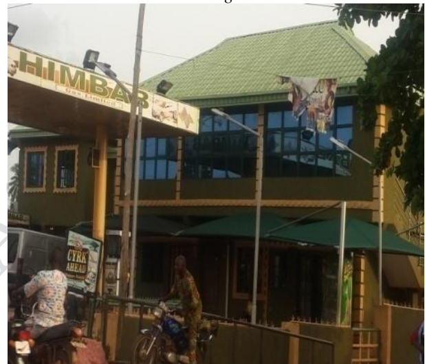
Plate 5: A building at Orita Ilaro