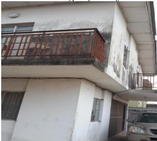
Table 5: Types of buildings