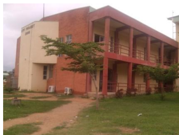
Figure 4: Thermal Mass, Chemical Engineering Department Lecture Theatre (CED LT)