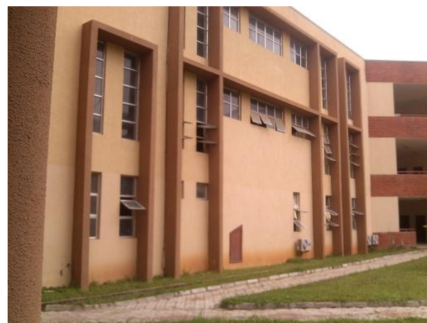
Figure 7: Shading devices, School of Information & Communication Technology Lecture Theatre (SICT LT)