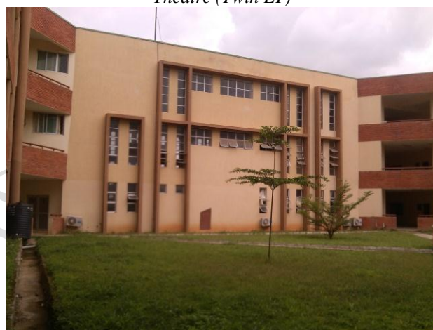
Figure 9: Vegetation, School of Information & Communication Technology Lecture Theatre (SICT LT)