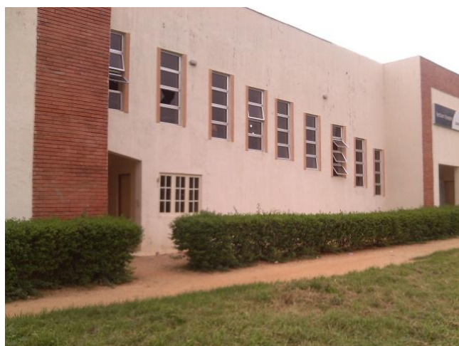
Figure 3: Building Envelope, School of Agriculture and Agriculture Technology Twin Lecture Theatre (SAAT LT)