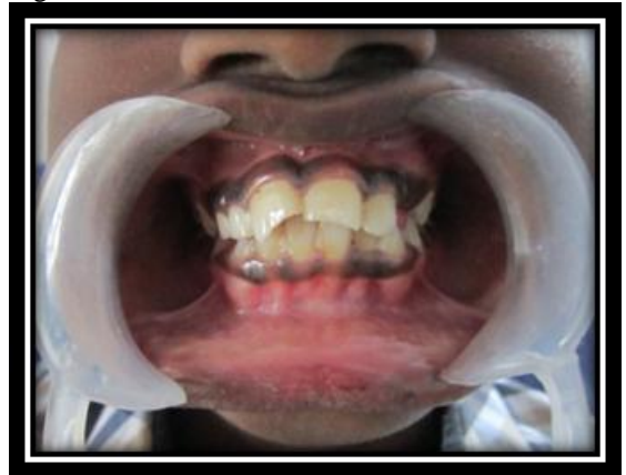
Figure 1: Pre operative view

fragment was tried in intraorally to check for proper positioning and fit with the fractured coronal structure.