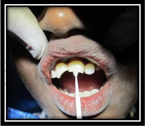
Figure 5: Application of bonding onto the tooth & the fragment agent