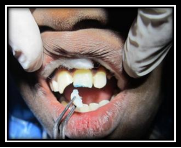
Figure 4: 37% phosphoric acid gel was applied