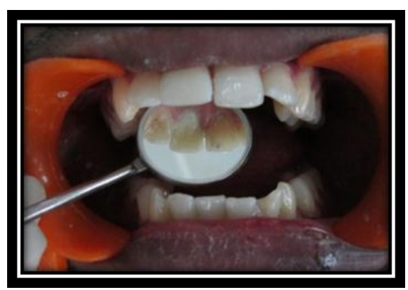
Figure 10: Post operative palatal view