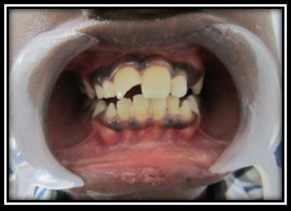
Figure 6: Post operative view

The operating field was isolated and the fractured surfaces of the tooth & fragments were cleaned with treated with 37% phosphoric acid gel for 30 seconds, followed by rinsing (Fig 4). The adhesive system (Prime and Bond NT, Dentsply) was then applied to the etched surfaces & light cured (Fig 5). Flowable composite (Ivoclar vivadent) was applied to both fragment and tooth surfaces. When the original position had been reestablished, stable finger pressure was applied on the