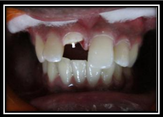
Figure 8: Cemented fiber post