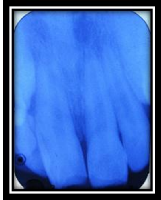
Figure 3: IOPA of 11 & 21