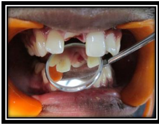
Figure 6: Pre operative view

The fragment was then adapted to the tooth and fit was verified. Resin cement (Multilink speed; ivoclar Vivadent AG, Schaan, Liechtenstein) was applied to the fractured fragment, the post and the fractured tooth and the fragment was carefully repositioned. Excess cement was carefully removed from the margins and final curing was done for 40 seconds. Margins were properly finished. The immediate postoperative view shows adequate esthetic results with restored functionality (Fig 9, 10).