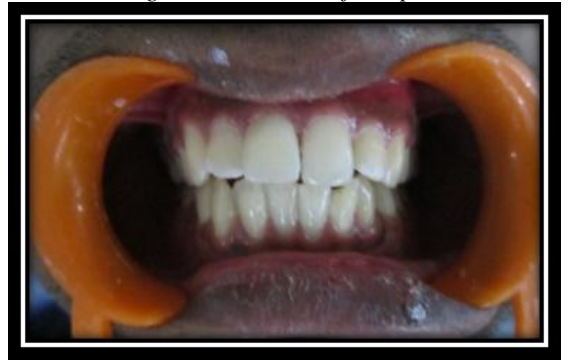
Figure 9: Post operative view