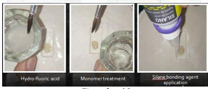
Figure 2 and 3