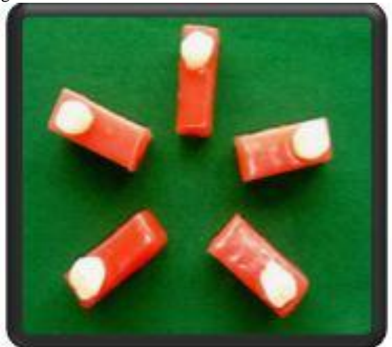
Figure 1: Wax Samples

using teeth with various chemical and mechanical surface treatments. (Fig-4) The final sample was obtained (Fig-5) the samples were tested for the shear bond strength using universal testing machine. Fig 6 shows the schematic representation of application of force to test the shear bond strength.the values were recorded.