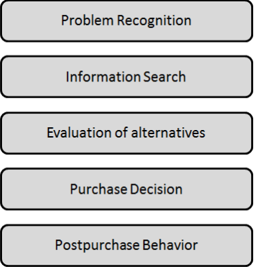
Figure 1: The five stage model in consumer behaviour by Kotler (2012)

Over the years marketing scholars have developed a "stage model" of the consumer decision process (shown below).