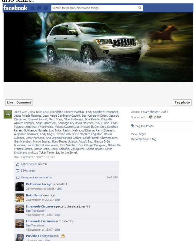
Picture 1: Jeep Facebook page: Interaction between the producers and consumer

products are posted regularly and followers comment, like and also share.