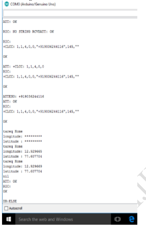
Figure 3: Serial monitor displaying location of pet

This system can be improvised to offer supplementary features like message, email alert for extreme temperature, health monitoring etc.