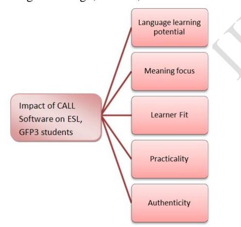
Figure 2: Conceptual framework for the impact of CALL Lab on enhancing the performance of GFP3 students- study with specific reference to Scientific College of Design, Muscat, Oman

The following figure illustrates the conceptual framework to study the impact of CALL Lab on enhancing the performance of ESL students with specific reference to the Scientific College of Design, Muscat, Oman.