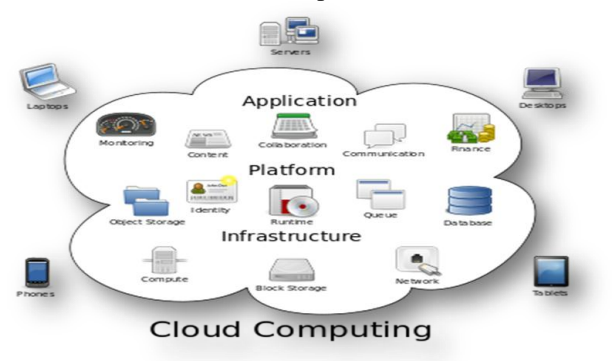
Figure 1: Structure of cloud computing

network (typically the Internet). The name comes from the common use of a cloud-shaped symbol as an abstraction for the complex infrastructure it contains in system diagrams. Cloud computing entrusts remote services with a user's data, software and computation. Cloud computing consists of hardware and software resources made available on the Internet as managed third-party services. These services typically provide access to advanced software applications and high-end networks of server computers.