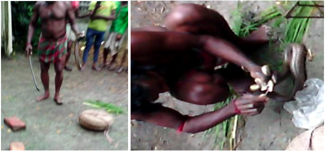
Figure 2: Snake catch and Venom teeth broken by blade

The catch snakes are keep them in the basket. These image are given below: