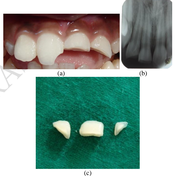
Figure 1: (a) Preoperative intaoral image (b) periapical preoperative radiograph (c) Fractured fragmnets

dental structures were acid etched 37% phosphoric acid (Ivoclar Vivadent AG, Schaan/Liechtenstein) for 15 seconds and thoroughly rinsed off. (Fig 3) A dental adhesive [Adper] Single Bond 2, 3M ESPE] was applied to all the fragments and light cured for 40 s and a flowable resin (Tetric Flow, Ivoclar Vivadent AG, Schaan/Liechtenstein) was used to adhere the fragments to the teeth; a thin layer of this resin was placed in the fractured surface of the teeth to allow for a small excess of material when the fragments were repositioned, then flowable resin was light cured for 60 s labially and palatally was applied to both the substrates. Finally, the residual excess at the restorative margins were finished and polished with Sof-Lex<sup>™</sup> Discs (Sof-Lex<sup>™</sup> Finishing and Polishing Discs: 3M ESPE). (Fig 4) Clinical and radiographic examinations were made after treatment. 12 months after the trauma, the patient showed no periodontal or periapical pathology, and no pulpal signs or symptoms. The teeth were found to be vital; the restoration was functional and aesthetically acceptable. (fig 5 (d).