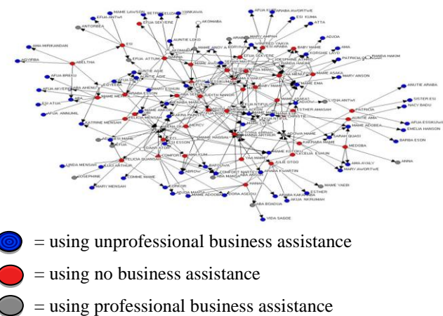
Figure 2: Sociogram of village E showing relationship of women's position in their social networks, types of business development assistance used and the assistance used by the network members

This means that the more connected a woman is, the less likely that she will use professional assistance in her business. To illustrate the association of social networks amongst the women, the sociogram of women in the village E is displayed in Figure 2.