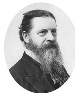
Figure 1: C.S. Peirce

C.S. Peirce was born in 1839 in Cambridge, the son of a Harvard Professor. Peirce had an excellent knowledge of the history of Philosophy. He was especially influenced by the scholastic thinkers. Peirce was an idealist, and thus he refused to accept a materialistic concept of nature. C.S. Peirce adopted the term Pragmatism from Immanuel Kant, who had made a distinction between the Pragmatic and the Practical. Peirce interpreted Pragmatism as a method whereby ideas can be made clear, not a utilitarian technique. When the philosophy of James became very popular, Peirce made it clear that his own view did not follow James's and he called his theory Pragmatism.