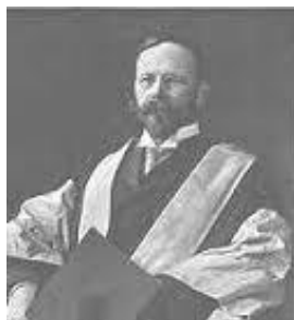
Figure 4: F.C.S.Schiller

In his Humanism, F.C.S. Schiller formulated a relativistic view of knowledge. Later, he expressed a deliberate preference for the Philosophy of Protagoras over that of Plato. The Presuppositions of human knowledge he regarded as practical postulates, rather than absolute axioms. Schiller acknowledged that man is doer rather than a knower: His practical interests come first. Moral and religious concerns play a