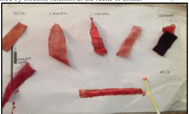
Figure 1: Fabric samples dipped in blood allowed drying ABO blood grouping for each dried sample was done by Absorption-elusion method. This is followed by cutting the stain fabric about 2mm long as followed by the procedure done in forensic investigation of real crime scene.

In almost all crime scenes when blood found as evidence is in dried form. So as here in study the mimic of crime scene was created in laboratory. For the forensic analysis Blood which was collected was dipped in different fabric and allowed to dry on different fabric surfaces in laboratory condition as shown in figure I. Thread was taken as control as used by forensic scientist at the scene of crime.